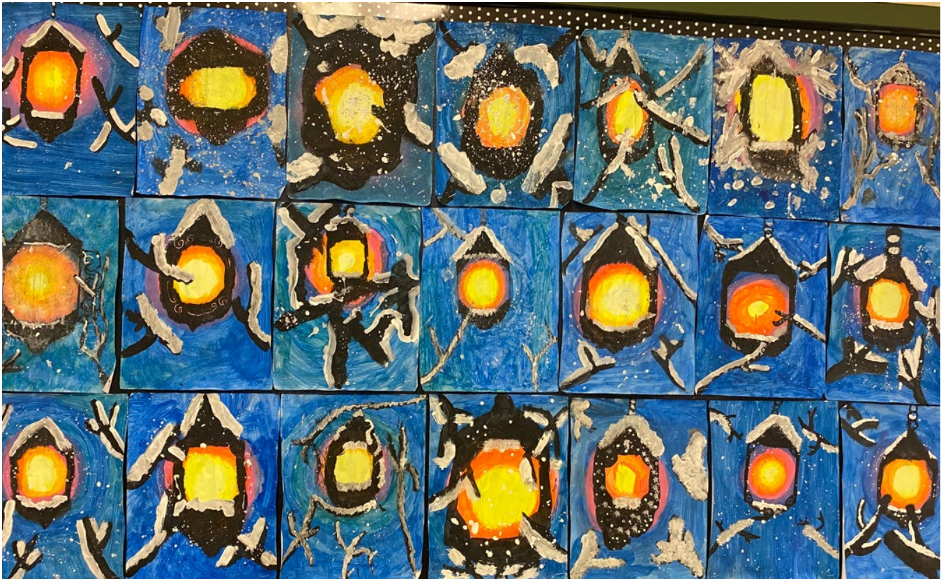
Enjoy the grade 5 Winter Artwork