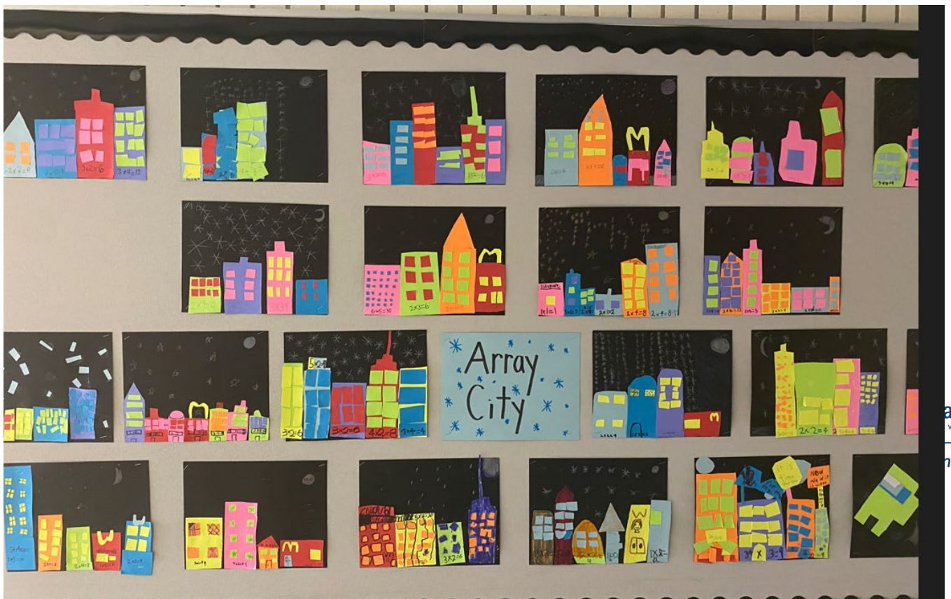
Enjoy the grade 3 Math-Art-ELA cross curricular work.