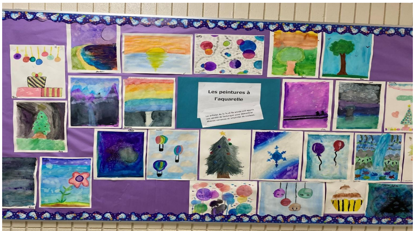
Grade 7-8 Holiday Artwork