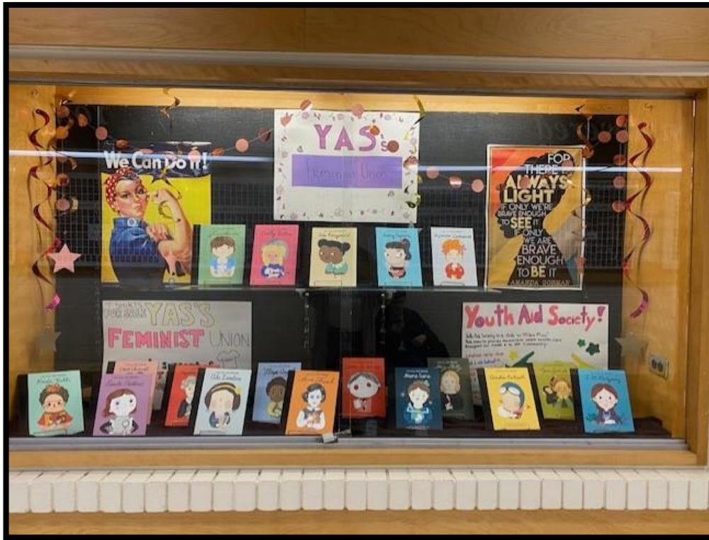
Our Feminist Union display outside the Library