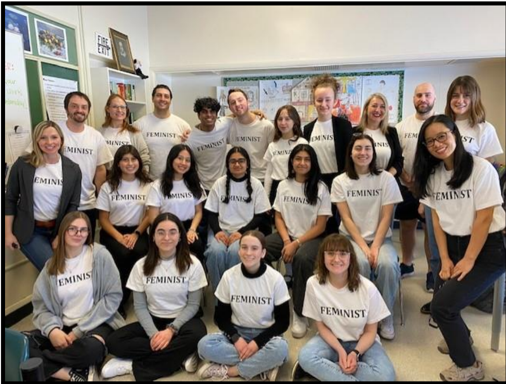
Our club and supporters modeling the t-shirt