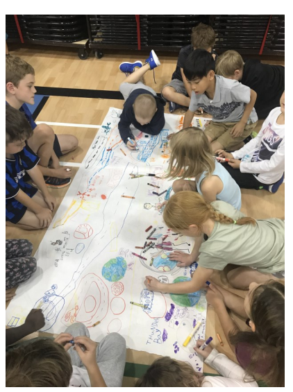
Students participating in Terry Fox Day activities.