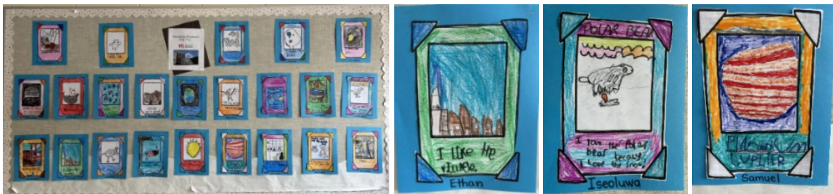
Written by the Incredible Grade 1 students in Room 3

We read the book, The Shape of my Heart and shared about what is in our own heart in a class sharing circle. We then drew and wrote about our ideas and displayed them in our classroom! We learned the importance of self-love and showing kindness to others.