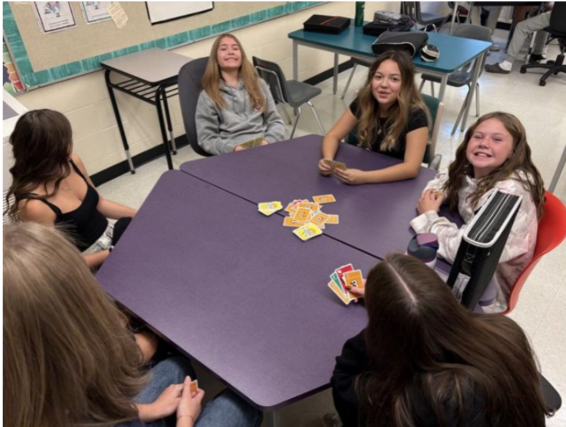
Math games – Ono 99