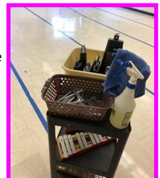
Mme Finlay's room