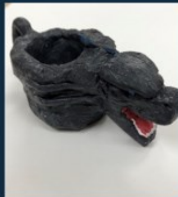
Clay vessel by Dominic C.

Make it mini! Artists in grade 8 had the opportunity to make anything---as long as it fit inside the palm of a hand. As you can see, some of the pieces are as small as a fingernail! This project took patience, dedication, and an eye for detail.