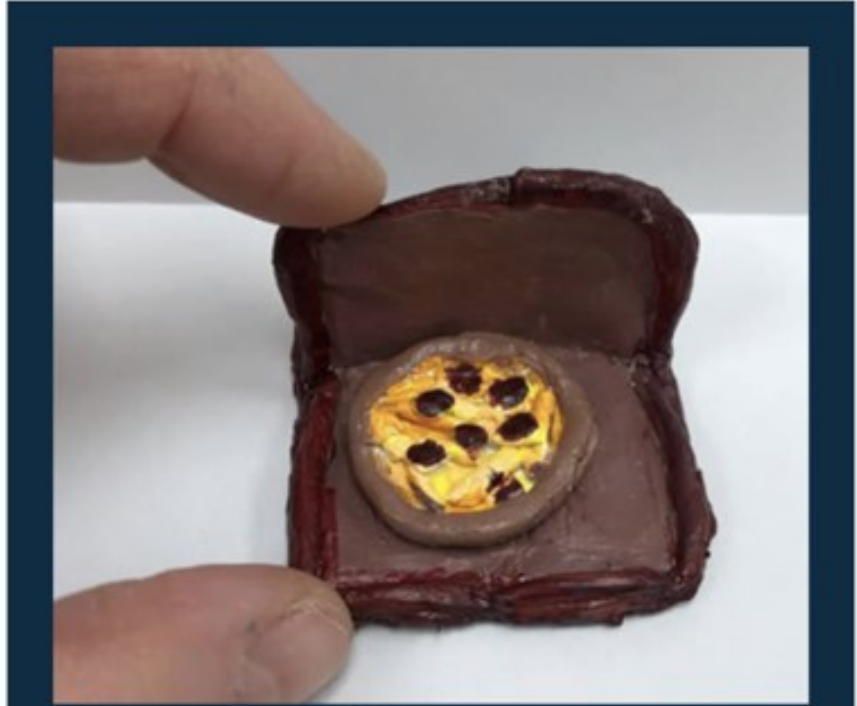
Pizza by Olivia T.