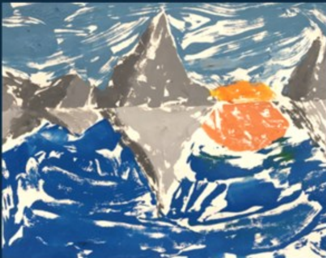
Kaylee B. - Foam stamp and acrylic paint