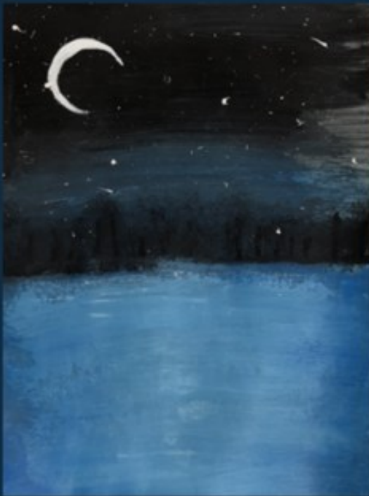
Peyton H. - Acrylic paint

Artists in grade 7 worked with so many materials---oil pastels, acrylic paint, watercolour paint, washable markers, and foam stamps. After experimenting with different media and subject matter, they focused on one material and created a final image of their choice. Many students said they liked having so much choice and independence.