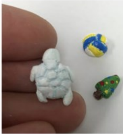
Turtle, volleyball, and tree by Caitie T.