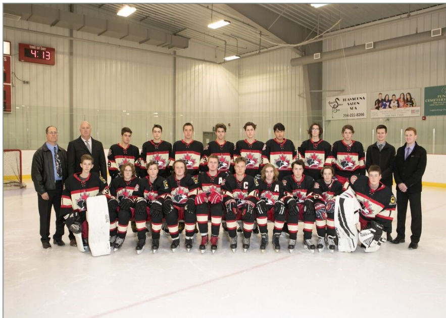
2017-18 CPET Canadiens Boys Hockey Team