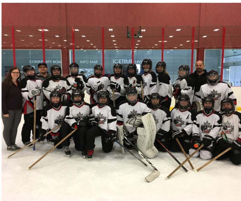
2017 CPET Canadiennes Ringette Team