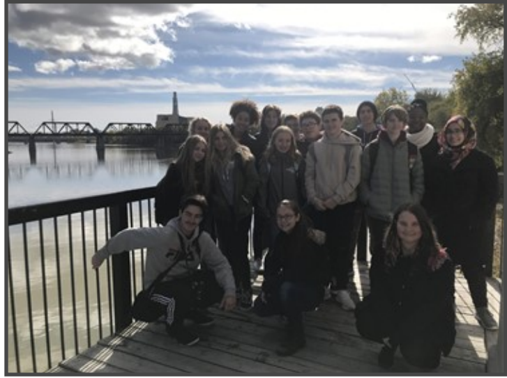
-Grade 10 imagerie numérique students

In this class, we are constantly challenged to be our best, creatively and personally and we are excited to continue with film for the rest of the semester