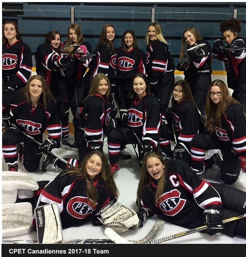
CPET Canadiennes 2017-18 Team

If there is one word to describe the Canadiennes first year in existence, it would have to be amazing!