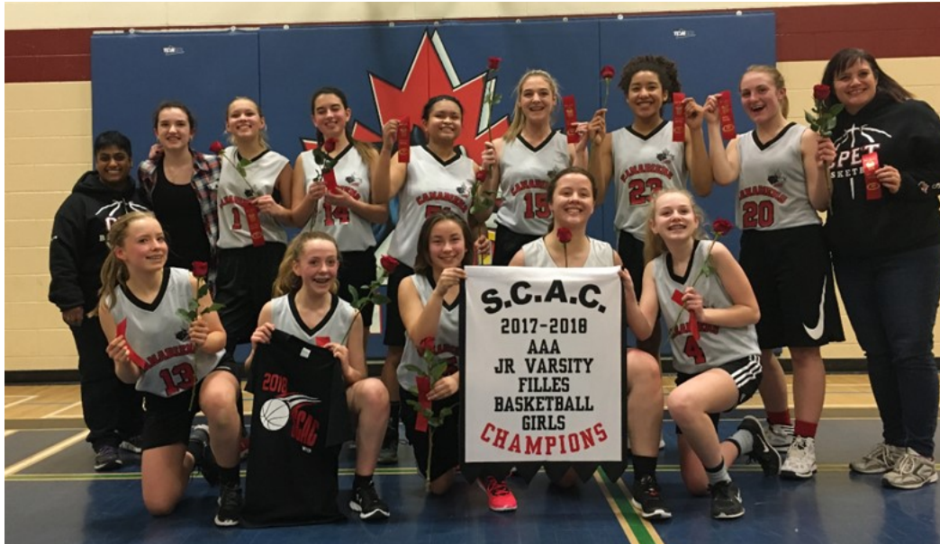
CPET Canadiennes JV Basketball Champions!!