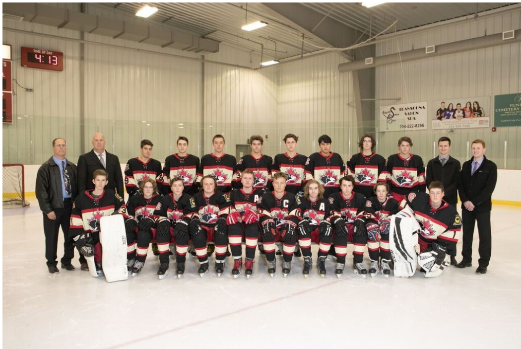
CPET Canadiens 2017-18 Hockey Team