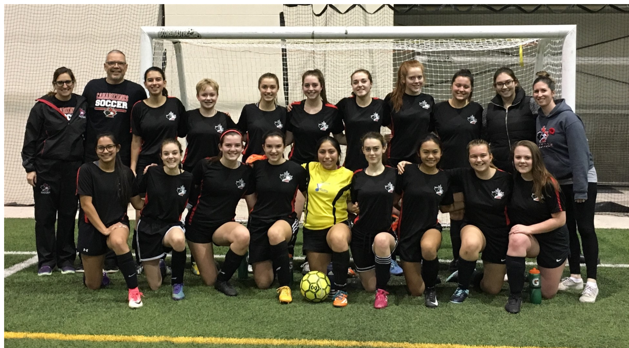
CPET 2018-19 Canadiennes Indoor Soccer Team. Full season report in Spring edition.