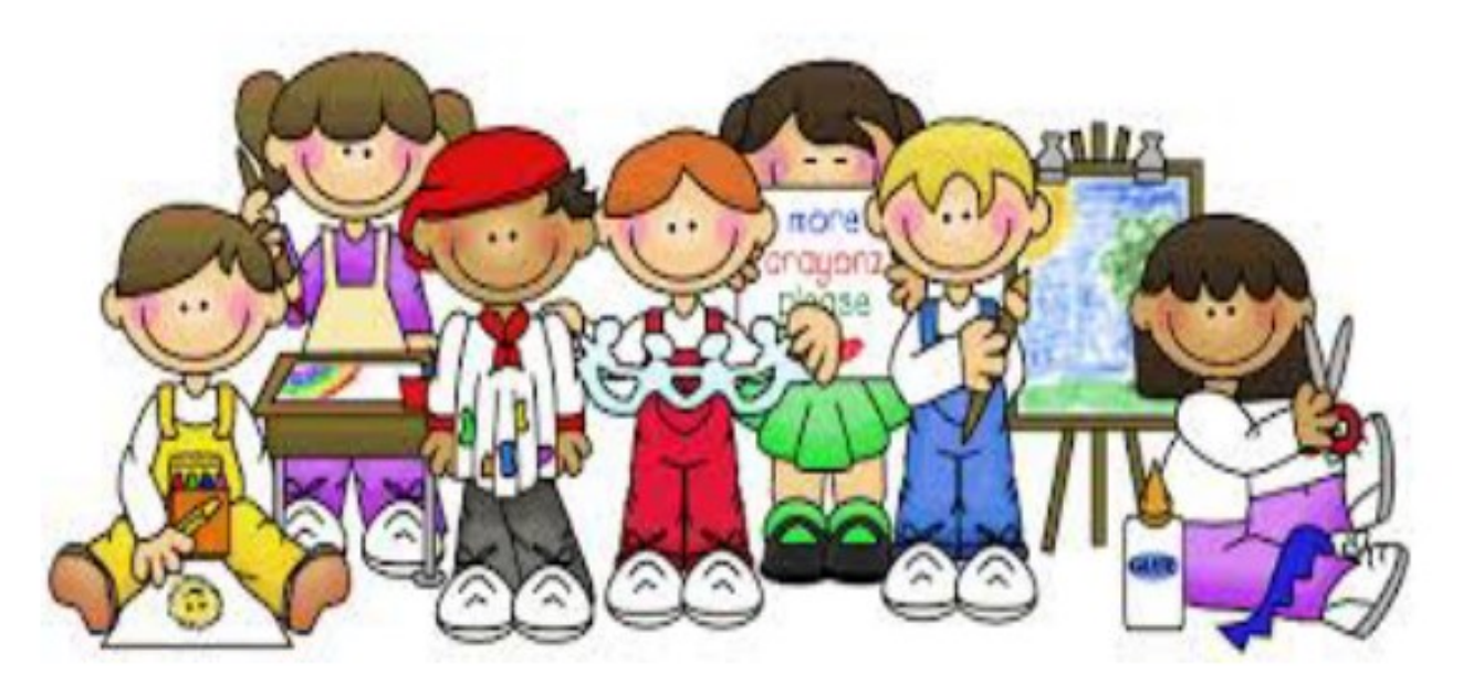
Come out and play!!!!!!!

Registration is weekly, and the program is absolutely FREE.