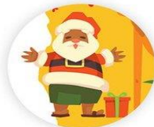
South Africa KRISMIS VADER