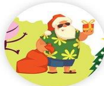
Brazil PAPAI NOEL