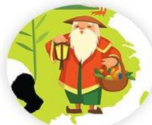
China DUN CHE LAO REN