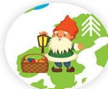
Sweden YUL TOMTEN