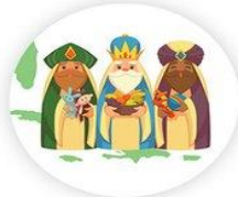
Cuba THE THREE KINGS