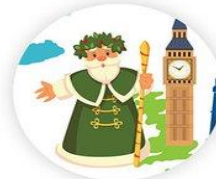
England FATHER CHRISTMAS