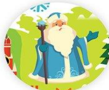
Russia DED MOROZ