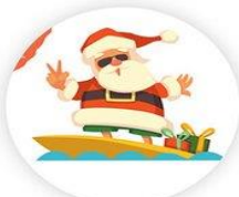
Australia SANTA CLAUS