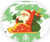
United States SANTA CLAUS